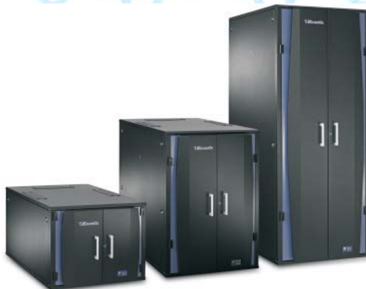
12U, 24U & 42U Models